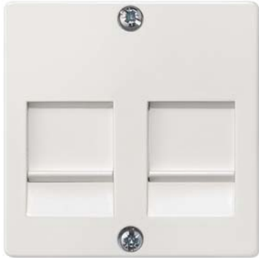
DELTA i-system titanium white Cover plate with shutter for support plates Modular jack connector