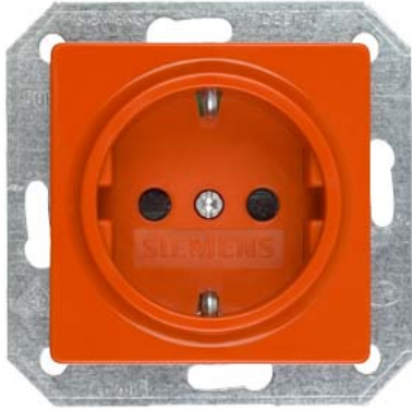
DELTA i-system SCHUKO socket outlet with increased touch protection orange, 55x 55 mm