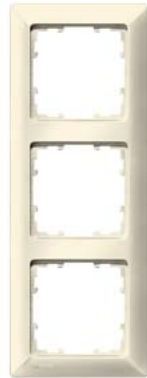
DELTA line, electrical white frame 3-fold, 222x 80 mm