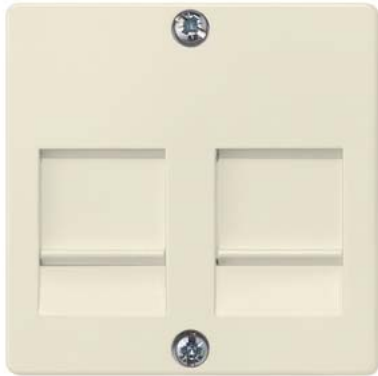
DELTA i-system electrical white Cover plate with shutter for support plates Modular jack connector