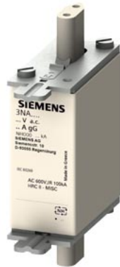
LV HRC fuse element, NH000, In: 16 A, gG, Un AC: 690 V, Un DC: 250 V, Front indicator, live grip lugs