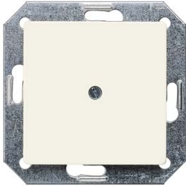
DELTA i-system titanium white blanking plate, 55x 55 mm