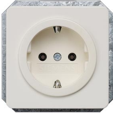
DELTA profil, titanium white SCHUKO socket outlet 10/16 A 250 V With screwless Connection terminals Cover plate 65x 65 mm