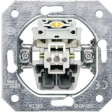
DELTA switch device insert FM, Monitoring switch off without claws 10A 250V