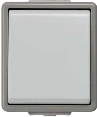
DELTA fläche IP44, AP Dark gray/light gray OFF switch 1-pole, 10A 250V 66x 75 mm