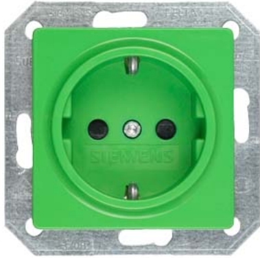
DELTA i-system SCHUKO socket outlet with increased touch protection green, 55x55 mm