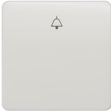
DELTA profil, titanium white Rocker switch with bell symbol for pushbutton, 65x 65 mm