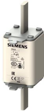
LV HRC fuse element, NH2, In: 35 A, gG, Un AC: 500 V, Un DC: 440 V, Front indicator, live grip lugs