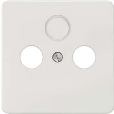
DELTA profil, Cover plate TV/RF/SAT 2 and 3 knockout holes titanium white