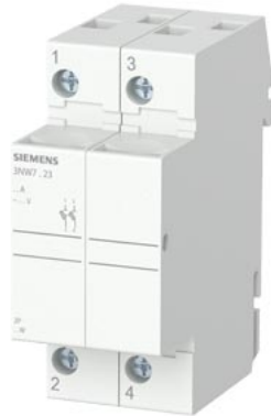
SENTRON, cylindrical fuse holder, 8x32 mm, 2-pole, In: 20 A, Un AC: 400 V