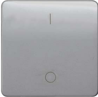
DELTA profil, silver Rocker switch with symbols I0 for OFF switch 2-pole, 3-pole 65x 65 mm