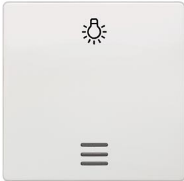
DELTA i-system titanium white Rocker switch with window with symbol light for pushbutton, 55x 55 mm