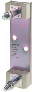
SITOR fuse holder 1250 A 1250 V 1-pole with bolt terminal with fixing dimension 110 mm