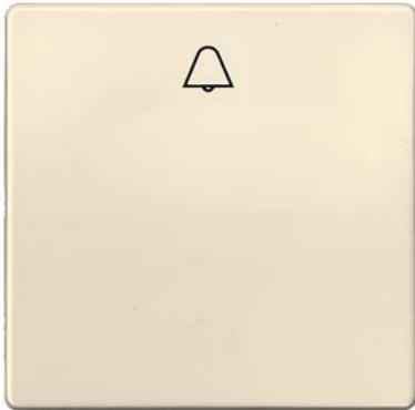
DELTA i-system electrical white Rocker switch with bell symbol for pushbutton, 55x 55 mm