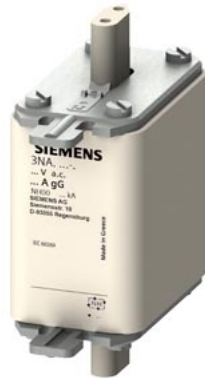
LV HRC fuse element, NH00, In: 160 A, gG, Un AC: 500 V, Un DC: 250 V, Front indicator, live grip lugs