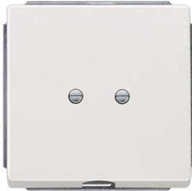
DELTA style, platinum metallic outlet plate, 68x 68 mm