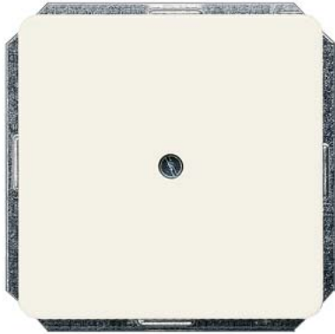
DELTA profil, titanium white blanking plate, 65x 65 mm