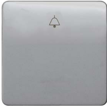
DELTA profil, silver Rocker switch with bell symbol for pushbutton, 65x 65 mm