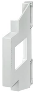
Spacer 0.5 MW