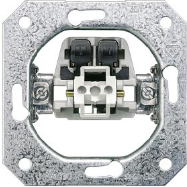
DELTA switch device insert FM, OFF switch 1-pole without claws 10A 250V