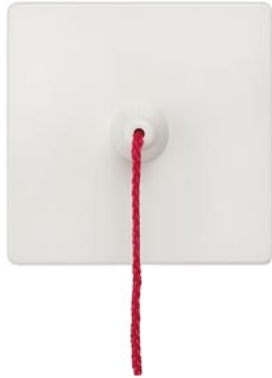
DELTA i-system Rocker switch with pull actuation for pushbutton titanium white, 55x 55 mm