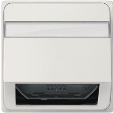
DELTA style, platinum metallic Inclined outlet for FOC mounting plates