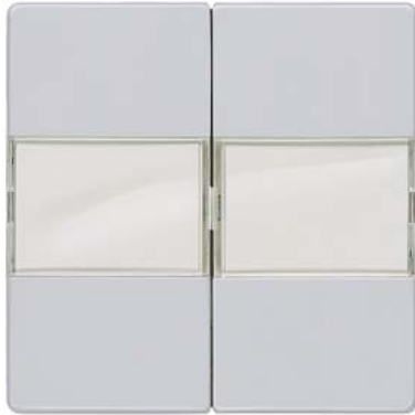
DELTA i-system aluminum-metallic Rocker switch with label for series/double two-way switch 55x 55 mm