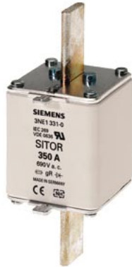
SITOR fuse link, with blade contacts, NH2, In: 350 A, gS, Un AC: 690 V, Un DC: 250 V, front indicator