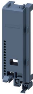
Contactor base size S00/S0