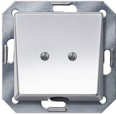
DELTA i-system aluminum-metallic outlet plate, 55x 55 mm