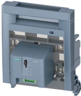
Handle unit with MFM, for Size NH2, accessory for fuse switch disconnector 3NP1