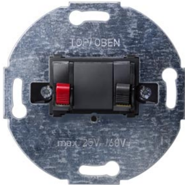
DELTA Loudspeaker connection socket 1-fold, 25V AC 60V DC up to 10 mm quadrant release lever