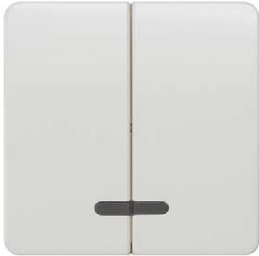
DELTA profil, titanium white Rocker switch with window for pushbutton 2-fold for pushbutton 2-fold Mid-position 65x 65 mm