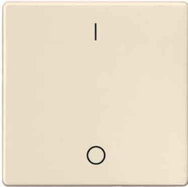
DELTA i-system electrical white Rocker switch with symbols I/O for OFF switch 2-pole, 3-pole 55x 55 mm