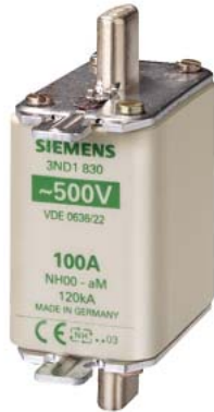
LV HRC fuse element, NH00, In: 100 A, aM, Un AC: 500 V, Un DC: 440 V, front indicator