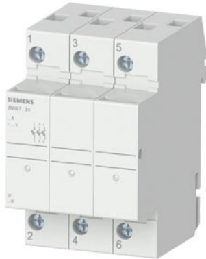
SENTRON, cylindrical fuse holder, 8x32 mm, 3-pole, In: 20 A, Un AC: 400 V, LED signal detector