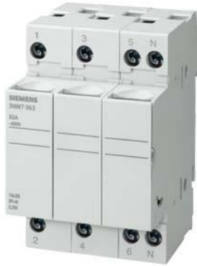
SENTRON, cylindrical fuse holder, 8x32 mm, 3P+N, In: 20 A, Un AC: 400 V