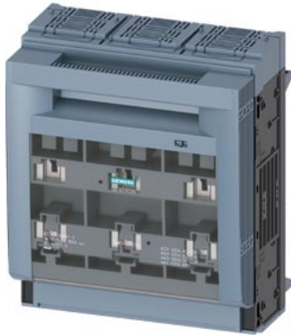
SENTRON, Fuse switch disconnecter 3NP1, 3-pole, NH3, 630 A, for Rittal busbar system 60 mm, flat terminal, Cover level 32/70 mm