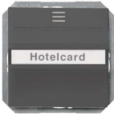
DELTA i-system HotelCard switch illuminated carbon metallic, 55x 55 mm