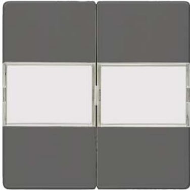
DELTA i-system carbon metallic Rocker switch with label for Series/double two-way switch 55x 55 mm