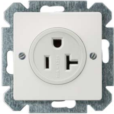
DELTA i-system NEMA socket outlet titanium white 2-pole+E NEMA 5-20 R 125V 20 A