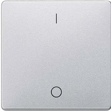
DELTA i-system aluminum-metallic Rocker switch with symbols I/O for OFF switch 2-pole, 3-pole 55x 55 mm