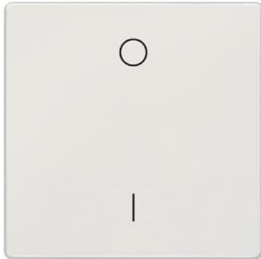
DELTA style, platinum metallic Rocker switch with symbol I/O for pushbutton, 68x68 mm