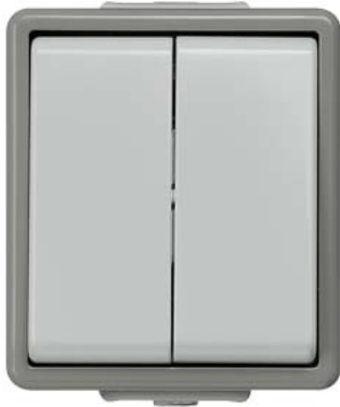
DELTA fläche IP44, AP Dark gray/light gray double two-way switch 10A 250V, 66x 75 mm