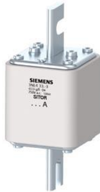
SITOR fuse link, with slotted blade contacts, NH2, In: 350 A, gR, Un AC: 750 V, front indicator